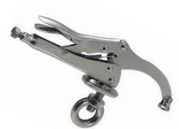
Drill Press Clamp