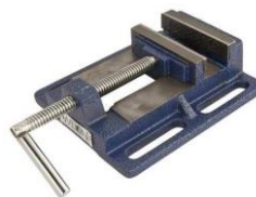
Drill Press Vise