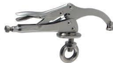
Drill press clamp