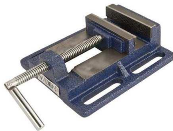
Table /drill press vise