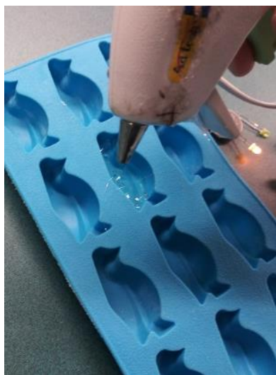
Squirt glue into molds